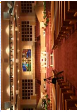
Reid Temple A.M.E. Church – New Construction Spring 2005

CECA is sponsoring the First Annual Children's Guild Golf Classic . This inaugural tournament is Friday, May 30, 2008 at Renditions Golf Course in Davidsonville, Maryland. The tournament's goal is to raise $25,000 to benefit the Children's Guild's Chillum School . The Chillum School is currently raising funds for the construction of a gymnasium/ multipurpose building on the grounds of its campus at 5702 Sargent Rd., Chillum, Maryland. The School, located in Prince George's County, currently has no indoor facility on school grounds to support its physical education program and assembly needs.